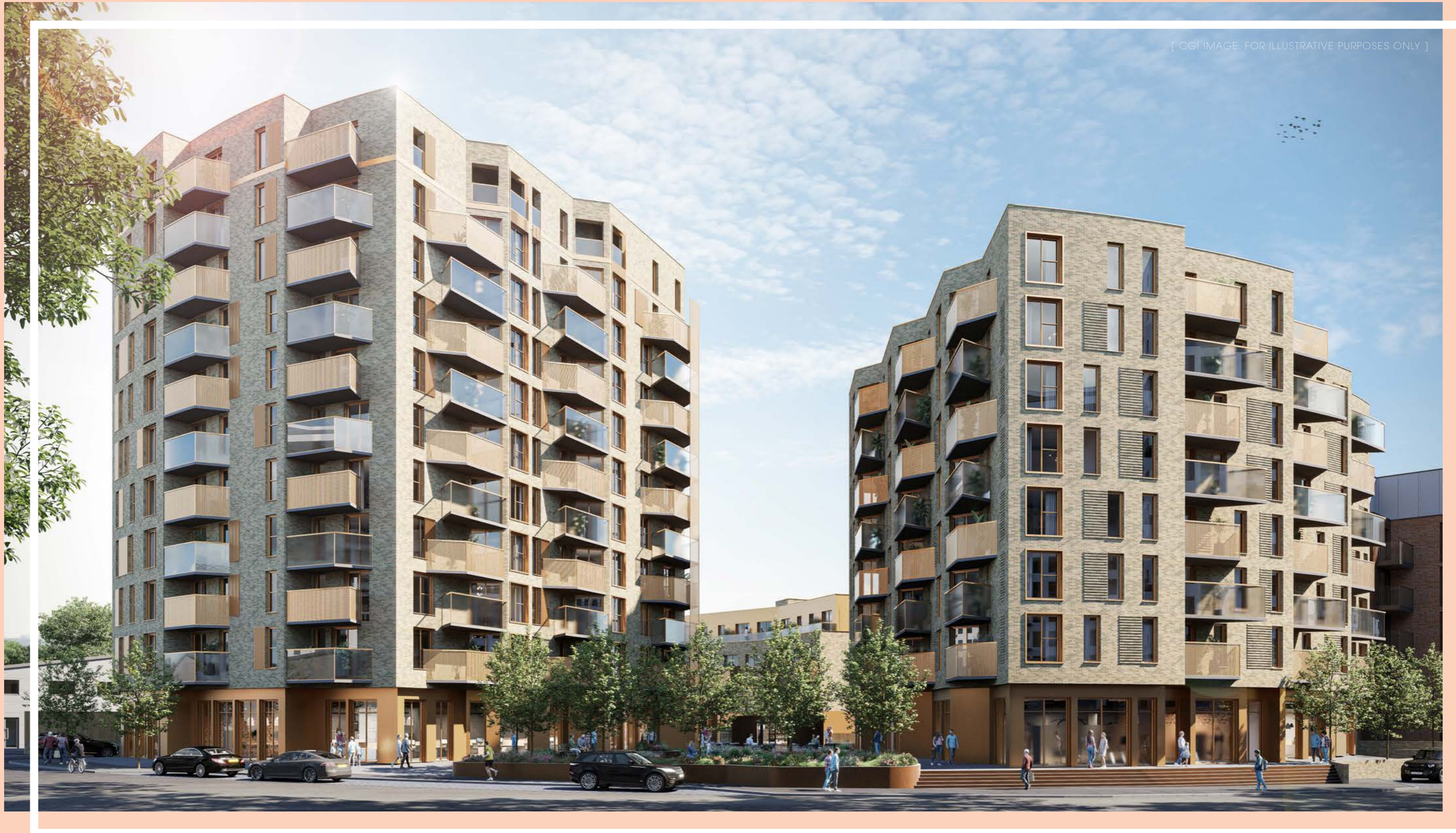
[ CGI IMAGE FOR ILLUSTRATIVE PURPOSES ONLY ]

An unrivalled opportunity in one of the UK's most vibrant and welcoming cities: The Goldstone Apartments is part of the exciting regeneration of a dynamic new residential neighbourhood in Hove. Minutes from Hove station, Hove Park and the beach, with Brighton on the doorstep and London just over an hour away, it offers enviable access to an amazing array of amenities for those who choose to make their home here.