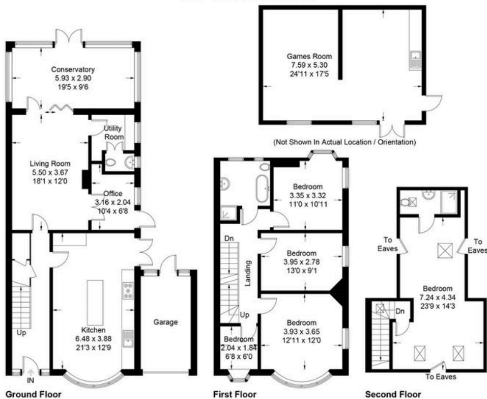
Illustration for identification purposes only, measurements are approximate.